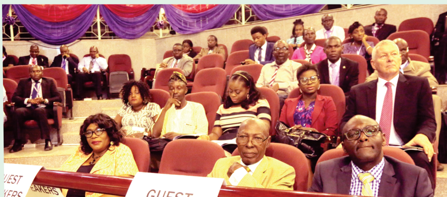
Cross section of participants at the CUCEN Conference