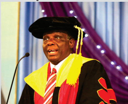
Professor Jerry Gana

them with high quality learning which emphasis skills not mere certificates. Skills