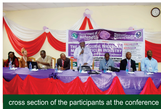
cross section of the participants at the conference

Mathematics study groups with industry, he pointed out, provide a forum for industrial scientists to work alongside academic mathematicians on problems of direct industrial relevance. A study group,