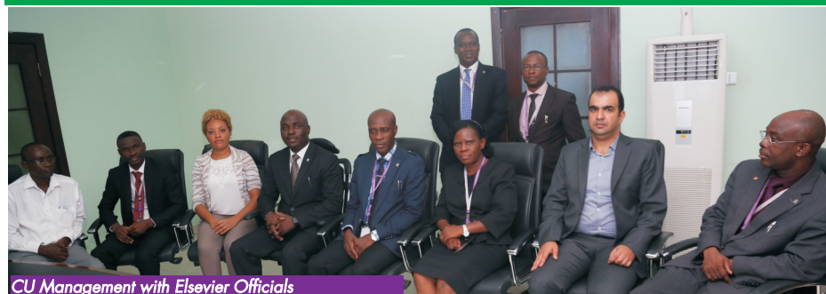
CU Management with Elsevier Officials

Elsevier, a world-leading provider of information solutions that help to make better decisions, deliver better care, and sometimes make groundbreaking discoveries in science, health, and technology, has expressed its desire of partnering with Covenant University in its efforts at rising to the top of world rankings of universities.