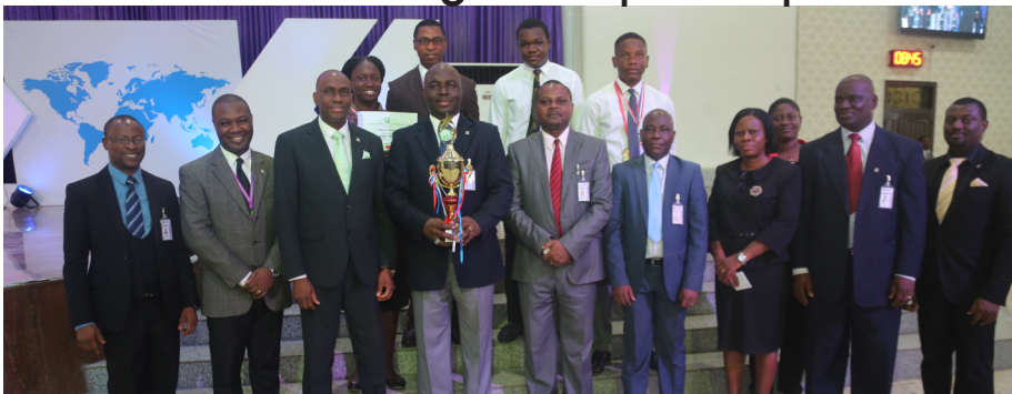
Covenant Management with the All Nigerian Universities Debating Championship (ANUDC) Winners